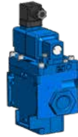
MAC 57 Series